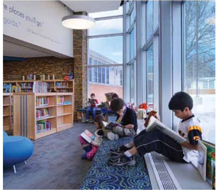
13,134 square feet Construction Cost $1,782,600