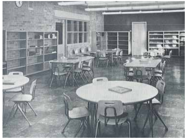
13,446 square feet Construction Cost $124,626