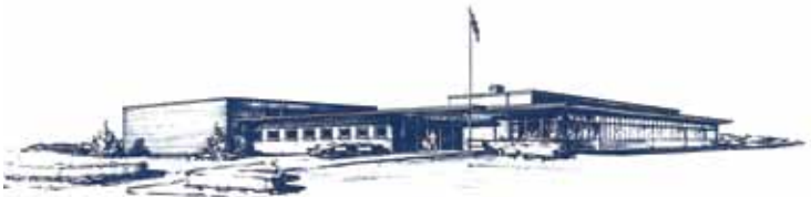
MINNESOTA ELEMENTARY SCHOOL FOR MINNESOTA, MINNESOTA. — ARMSTRONG & SCHLICHTING, ARCHITECTS, Mpls.